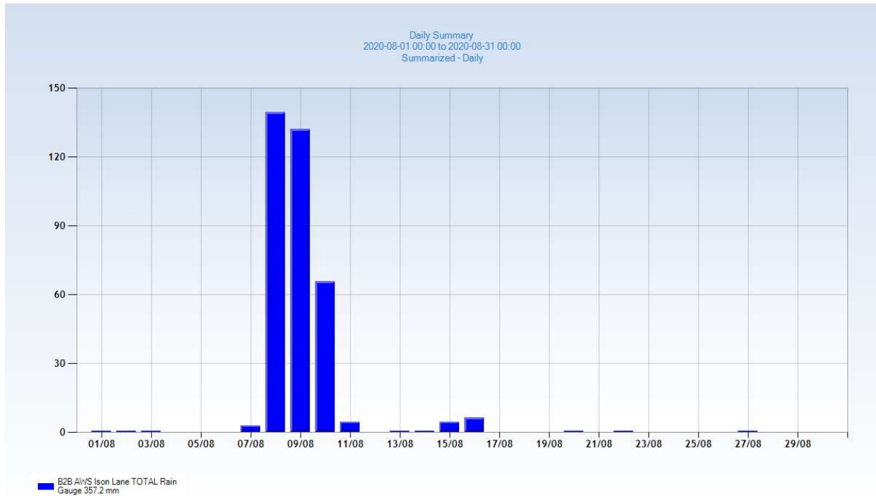
Figure 3-1 August Rainfall Results from Ison Compound Weather Station

Mild conditions prevailed earlier in August with several days experiencing high wind speeds in the latter half of the month. The predominant wind direction for August was from WSW. The highest wind gust recorded was 69.8 km/h and the maximum wind speed was 46.6 km/h (refer Figure 3-2). DSWJV continue to monitor site activities, implement dust suppressant across site, utilise a fleet of water carts during working hours and limit dust generating activities and/or suspend work activities on days of high wind.