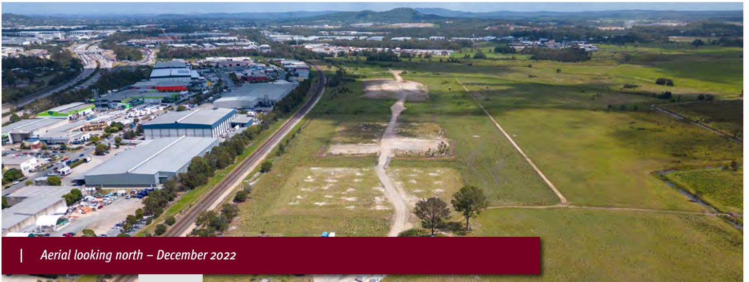
| Aerial looking north – December 2022