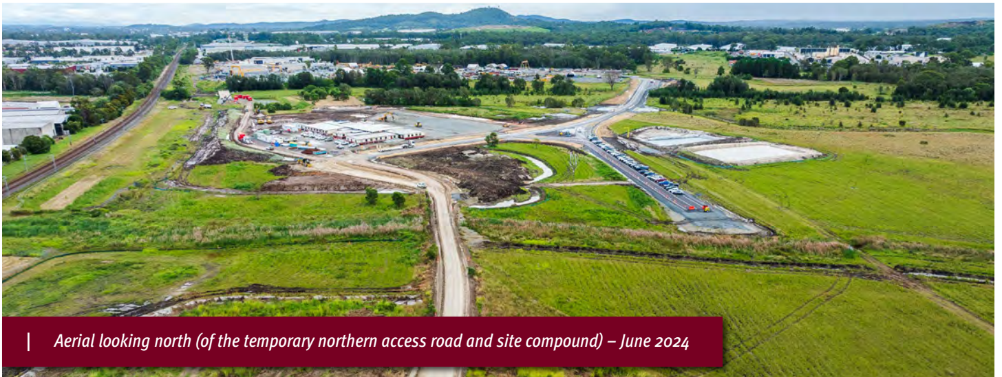
| Aerial looking north (of the temporary northern access road and site compound) – June 2024