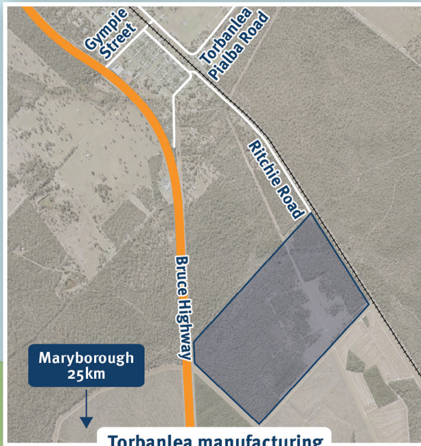
Torbanlea manufacturing facility site