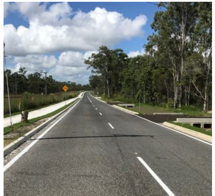
Completed Ritchie Road upgrade – Ritchie Road is the permanent access to the Torbanlea train manufacturing site for light vehicles.

Heavy vehicles access the site via the Bruce Highway.