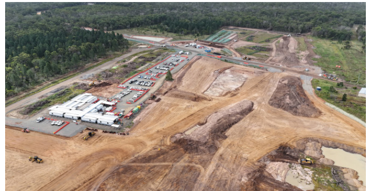
Aerial progress photo of the train manufacturing facility site – July 2024