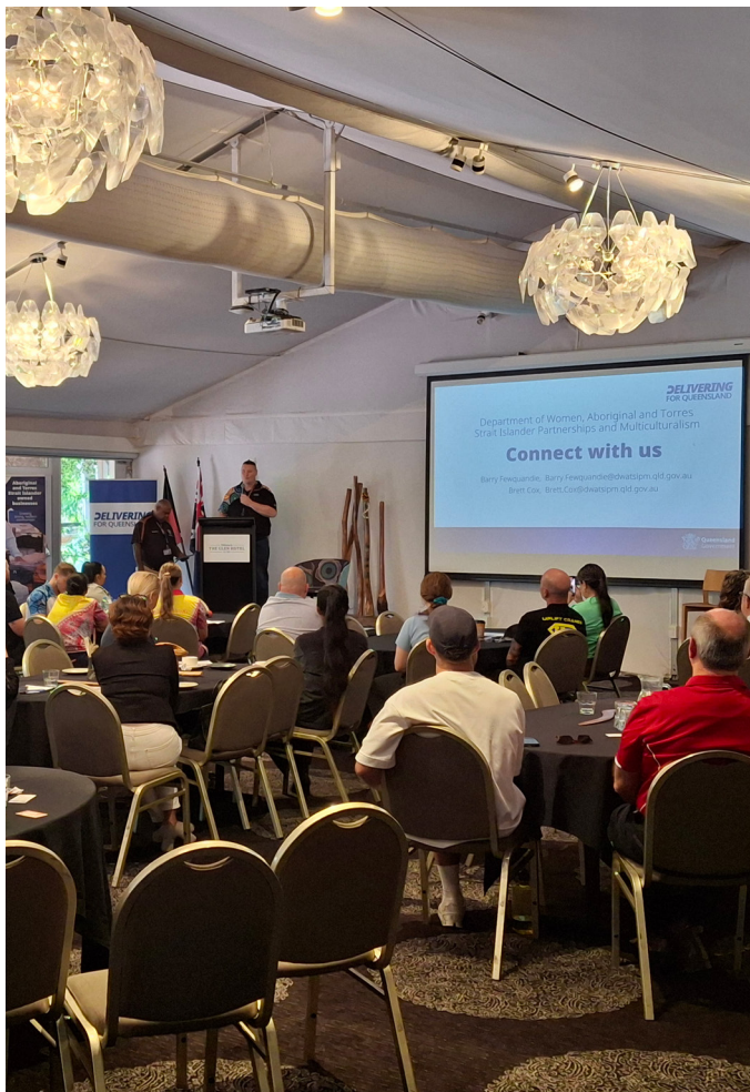
Image: Indigenous Businesses listen to the DWATSIPM team during the workforce connect event.

A joint collaboration between DWATSIPM and the Department of Trade, Employment and Training (DTET), the inaugural Indigenous Workforce Connect was attended by over 100 community members, with panel discussions and presentations about how to improve First Nations business capability for upcoming events like the Brisbane 2032 Olympic and Paralympic Games. Teams participating in panels included Moonyah Workforce, DCC Industry Group, CleanCo, BindiLee Painting Services, Feros Care, Paperbark Consulting and Al Mucci Enterprises.